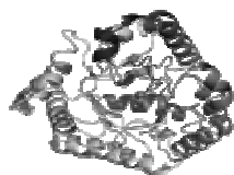
Global structure of SsoPox