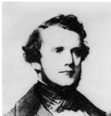
© 2015 International Union of Crystallography

The upper part of Fig. 8.2.1.1 contains the rather coarse classifications of the space groups into '6 crystal families', '7 lattice systems' and '7 crystal systems'. The 'crystal-system' classification arose from mineralogists in the 18th and 19th centuries who had no knowledge of space groups. The '7 lattice systems' and '7 crystal systems' are different but very similar. In those situations where they differ, one finds considerable confusion in