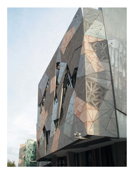
© 2015 International Union of Crystallography

Keywords: aperiodic crystals; incommensurate modulated structures.