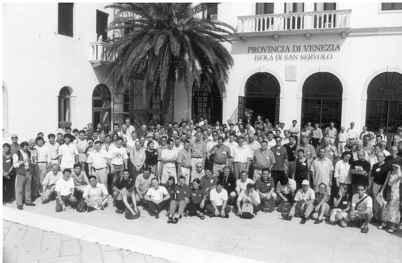
Figure 2 SAS participants during a break from the meeting.