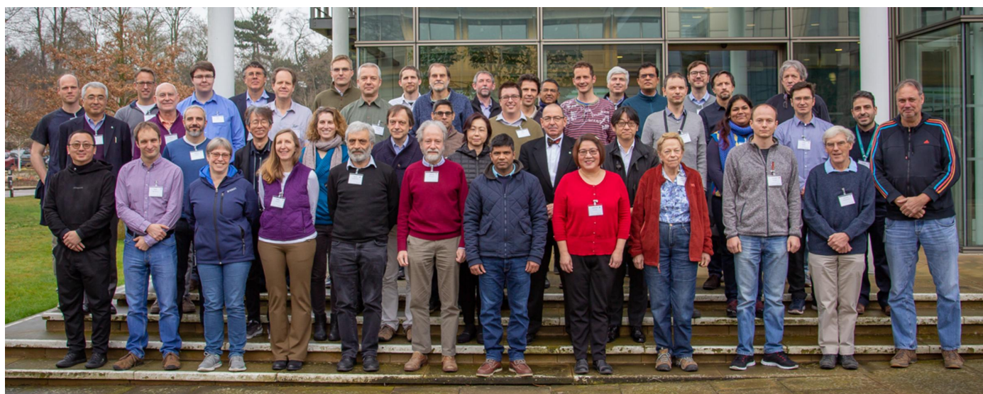
Figure 2 Participants in the workshop (not in the photo: S. Abbott and S. J. Ganesan).

The workshop was held over two days. On the first day, there were several introductory presentations outlining some of the history, explaining what information is captured during the deposition process and describing the contemporaneous validation reports. The participants then split into three groups that each discussed the same list of topics and questions prepared by the organisers. Break-out sessions on the first day addressed data and deposition requirements, and on the second day validation metrics and reporting were discussed. The meeting concluded with reports from the three groups and a plenary discussion. The participants in the workshop are shown in Fig. 2.