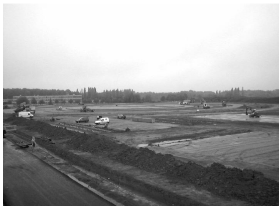
Construction site of Soleil.

The construction of Soleil has started in earnest. The shape of Soleil can begin to be seen from a recent photograph taken in early October 2003 (shown on the right). Soleil is located close to the current French synchrotron facilities DCI and Super-ACO at LURE in Orsay. LURE will close in December 2003. The close proximity of the original synchrotron radiation laboratory to Soleil has allowed an efficient transfer of skilled staff from LURE. Soleil expects to begin operation in January 2006 with 12 beamlines. To cover the two-year dark period, a new beamline has been built at the Swiss Light Source in Zurich, Switzerland, and arrangements have been made with several synchrotrons, including Elettra in Italy and the National Synchrotron Light Laboratory in Brazil.