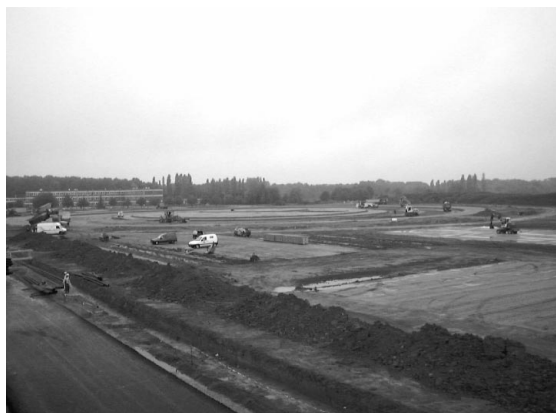
Construction site of Soleil.

The construction of Soleil has started in earnest. The shape of Soleil can begin to be seen from a recent photograph taken in early October 2003 (shown on the right). Soleil is located close to the current French synchrotron facilities DCI and Super-ACO at LURE in Orsay. LURE will close in December 2003. The close proximity of the original synchrotron radiation laboratory to Soleil has allowed an efficient transfer of skilled staff from LURE. Soleil expects to begin operation in January 2006 with 12 beamlines. To cover the two-year dark period, a new beamline has been built at the Swiss Light Source in Zurich, Switzerland, and arrangements have been made with several synchrotrons, including Elettra in Italy and the National Synchrotron Light Laboratory in Brazil.