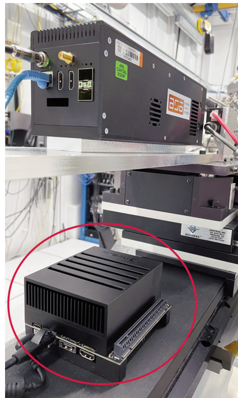
Pictured above is the Jetson edge device (circled) running PtychoNN, which makes live predictions from the detector (top) data stream and sends them to the beamline computer.