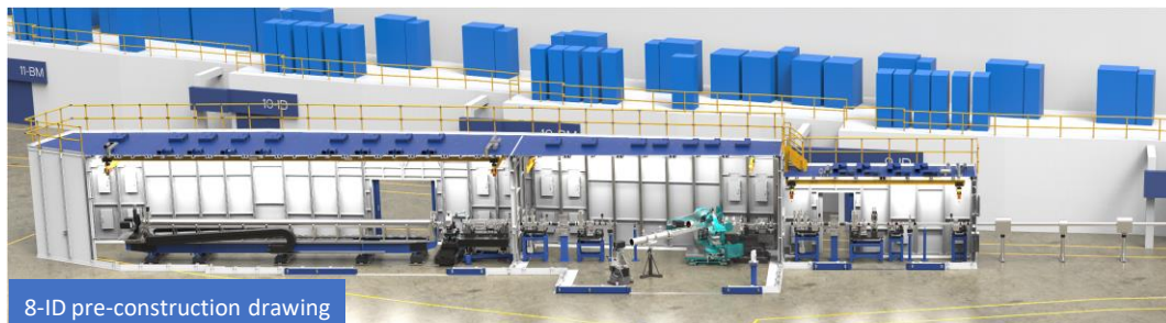
8-ID pre-construction drawing

The Advanced Photon Source (APS) Upgrade will not only improve the facility's X-ray beam, it will deliver new beamlines that will benefit from those improvements. Two of those beamlines sit next to each other, in sectors 8 and 9 of the APS, and they will use the increased brightness (up to 500 times) of the beam and its increased coherence. The X-ray Photon Correlation Spectroscopy (XPCS) beamlines at 8-ID-E and 8-ID-I will enable wide- and small-angle XPCS, respectively, for studies in a host of key areas of physics and materials science. XPCS is designed for hard and soft matter studies and will facilitate research into the structural dynamics of liquids, gels, glasses and quantum materials. Next door, the Coherent Surface Scattering Imaging (CSSI) beamline at 9-ID will investigate surface-interface phenomena, combining grazing incidence scattering and coherent imaging techniques. The CSSI beamline will enable studies into thin film and quantum dot growth and the structure of 3D nanoscale electronic circuits. Both beamlines are under construction and are expected to be operational in 2024.